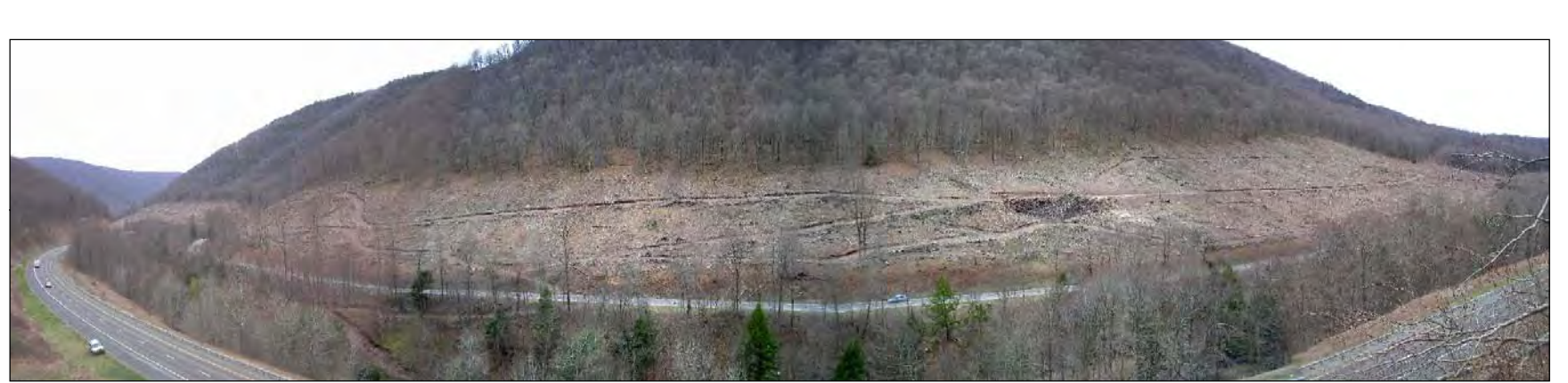
Photo site 3 -- Merged photos looking south to west over Route 15; timber has been cut in preparation for road realignment on southbound

Wisconsinan glacial extent. Teeth point toward ice. USGS GWSI water well Highway realignment Section C41 Mapped landslides