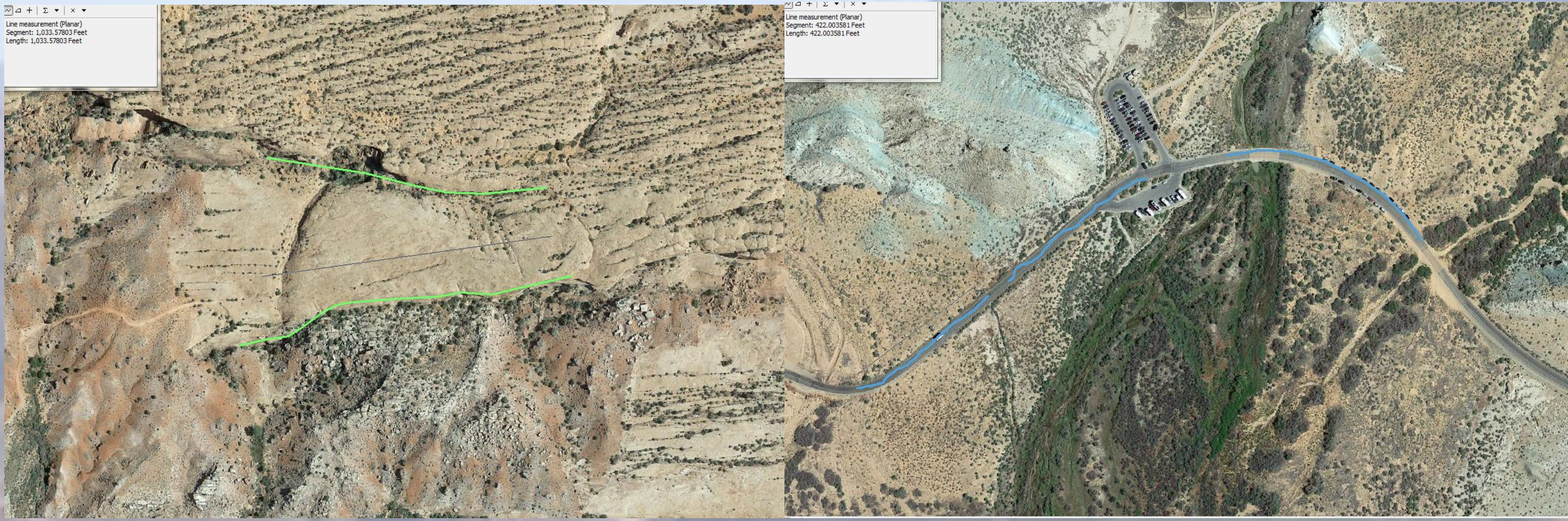
Test done at Arches National Park, lines were drawn above, below, and on the ground. In a 2D environment the x-y shift was negligible, especially when compared with user precision.

Map Accuracy • Due to the nature of having a z-axis, x-y shifts were thought to be problematic with line accuracy • Shifts were found to be a minimal issue